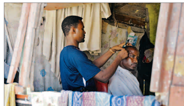
Shebab's dress code includes short hair and long beards for men.

One youth in Adle village, near Mogadishu, recounted how his