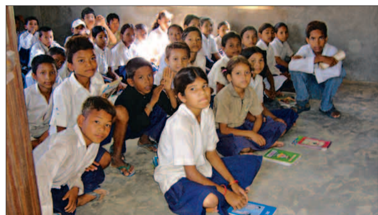
Children receive support right up until they graduate from college or complete vocational training

That's certainly something worth raising a glass or two to.